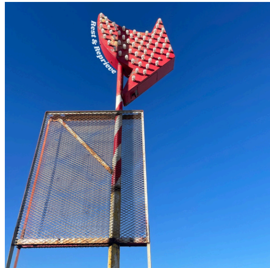
Rest & Reprieve