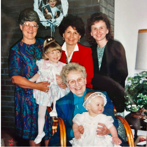
Face to Face